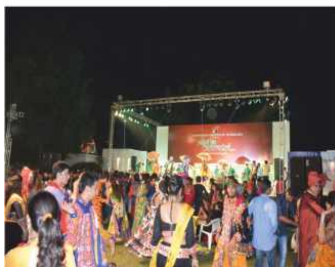
GITians rocking on "Garba Beats"