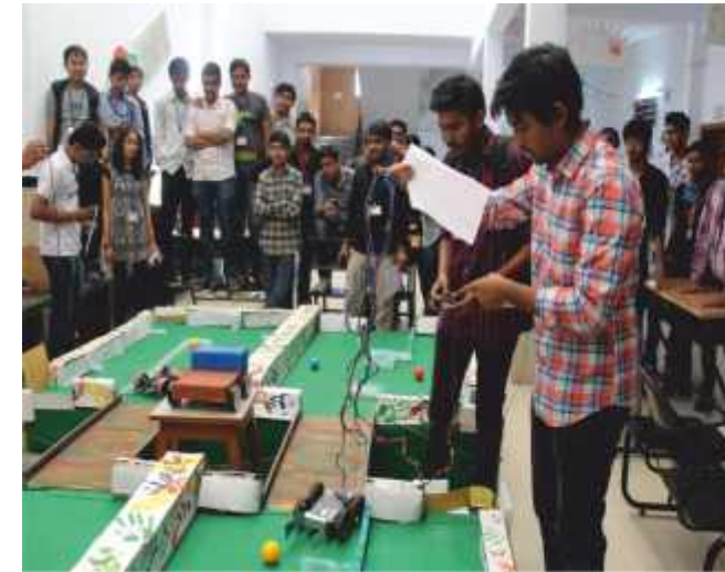
Participate performing tedious task