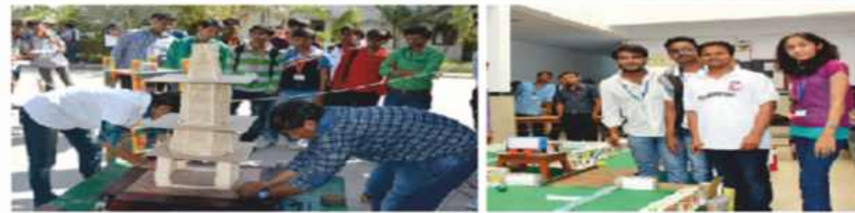
Ahmedabad Mirror, 16/02/2015