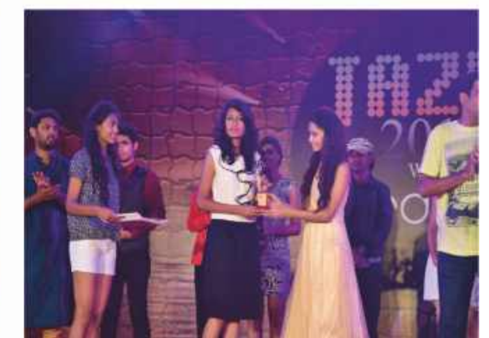
Judges Congratulating the Winners