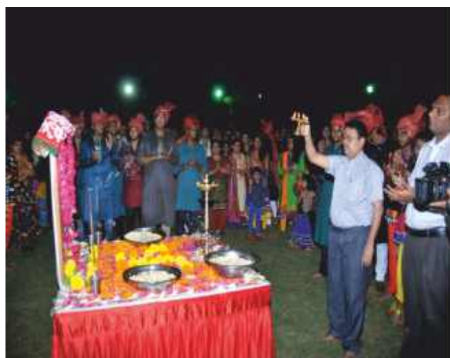
"Aarti" at GIT Campus on the day of Ratri B4 Navratri