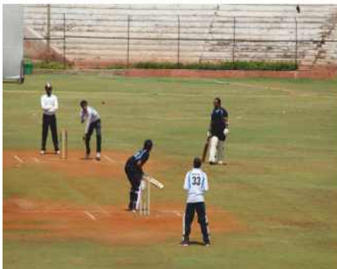
Photo from the Commentary Box