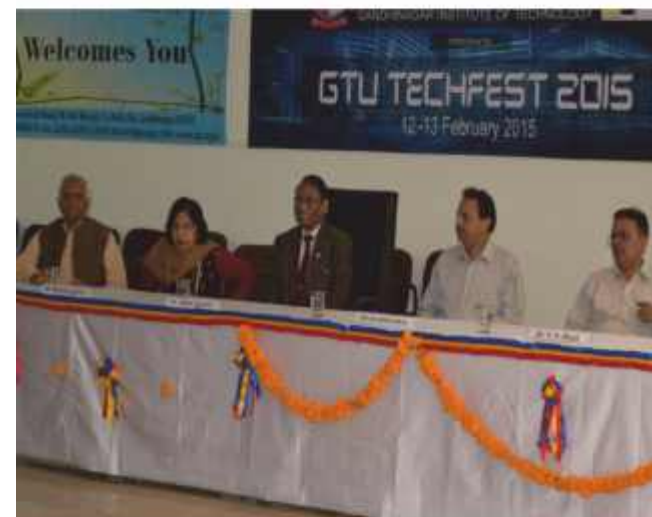
Dignities on the Dias