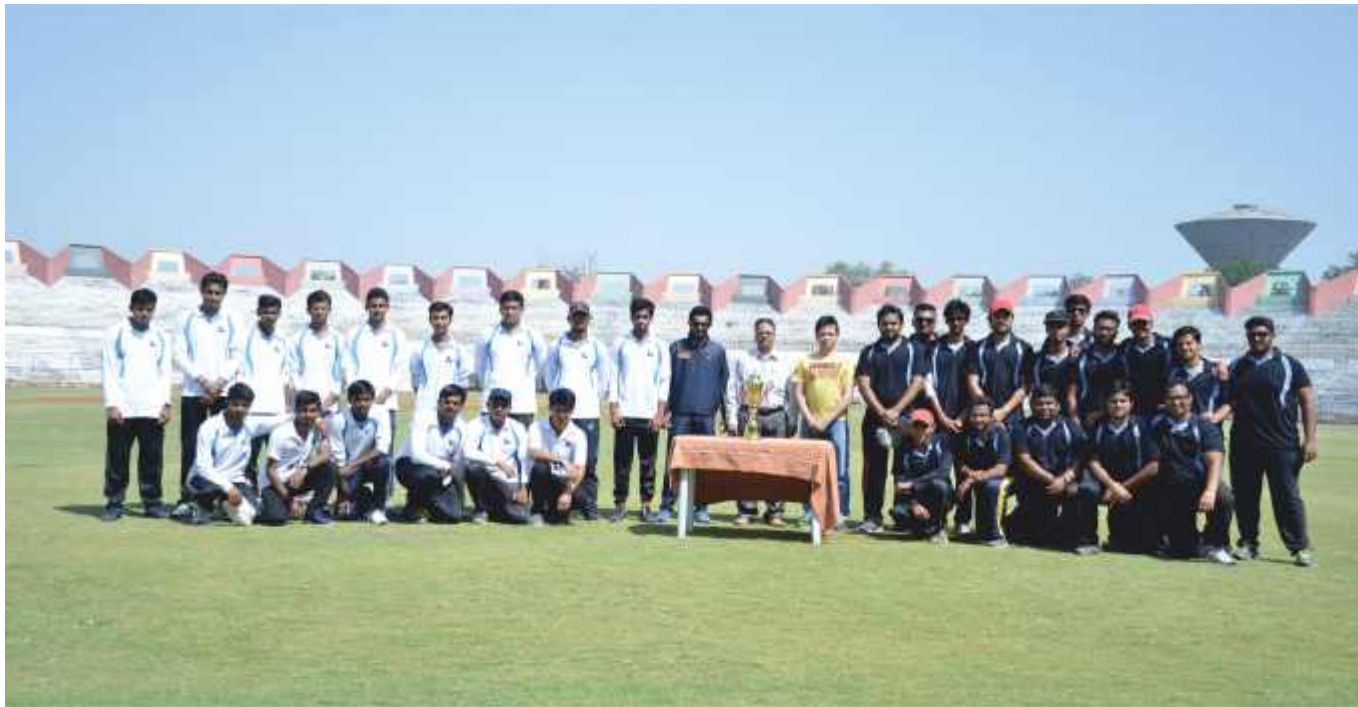
Group photo of Finalist at Sardar Patel Cricket Stadium, Ahmedabad

Sports Events have always been for students and by the students. Sports keep them physically and mentally fit and also inculcate discipline, brotherhood and true sportsmanship. Their hard work and desire to make an event success is second to none and GIT Annual Sport 2015 was one of the very good example of it. Students, faculty members and staff participated with great enthusiasm and showed their game spirit.