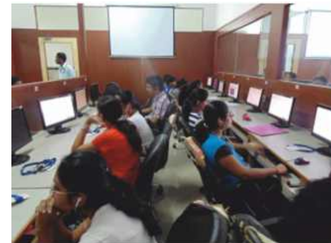
Student Participated at C-102/A

All the departments have participated in various workshops of FOSS with the help of IIT-Bombay Spoken Tutorial Team.