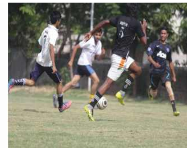
Final Round Match at Kahaani Football Club