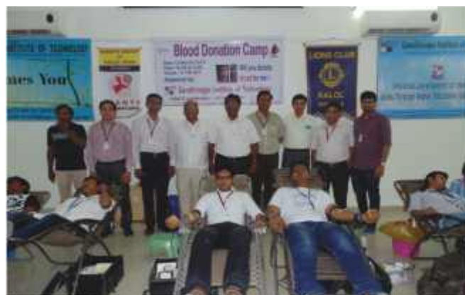
Dignitaries present at "Blood Donation Camp"