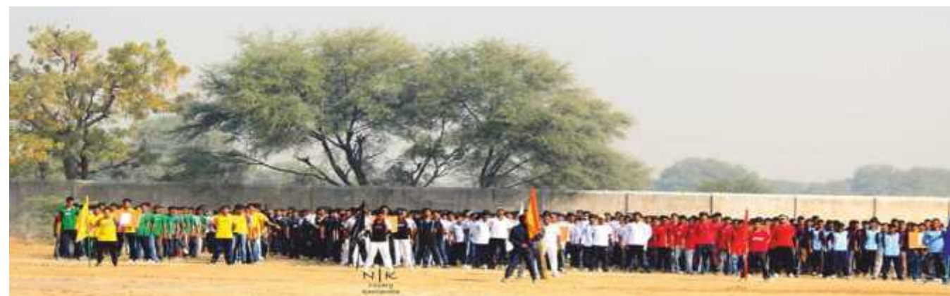
GIT Students taking Oath During March-Pass