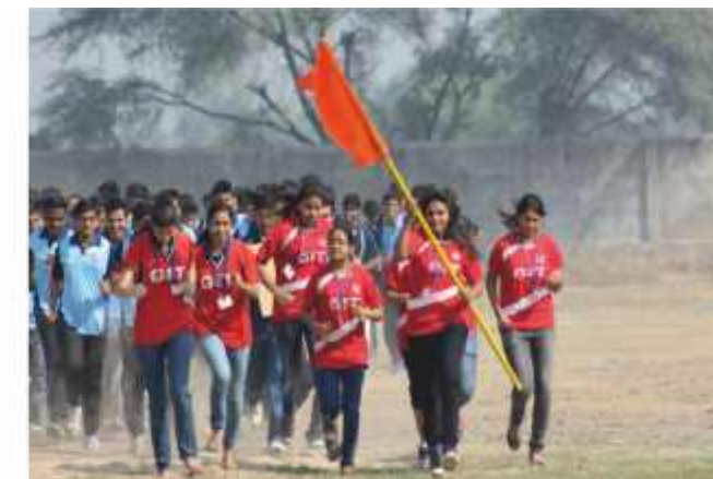
Student Running for March-Pass