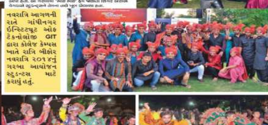
નવરાત્રિ આગળની રાતે ગાંધીનગર ઈન્સ્ટિટ્યુટ ઓફ ટેકનોલોજી GAT દ્વારા કોલેજ કેમ્પસ ખાતે રાત્રિ બીસેટ નવરાત્રિ ૨૦૧૪નું ગરબા આયોજન સ્ટુડન્ટ્સ માટે કરાયું હતું.