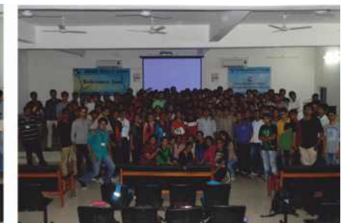
Group photo of Flash Venture & Business Model Canvas Workshop Participants