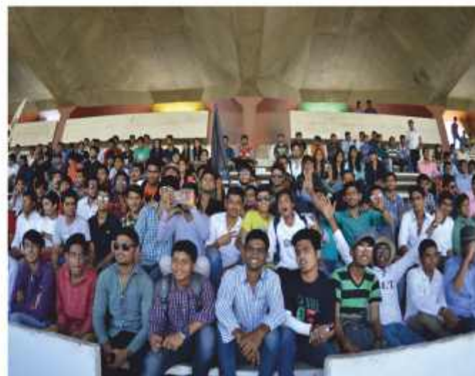
Crowd enjoying the Cricket Match