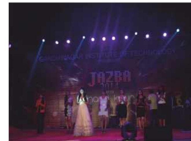
Glimpse of Mr and Mrs GIT - A Talent Hunt