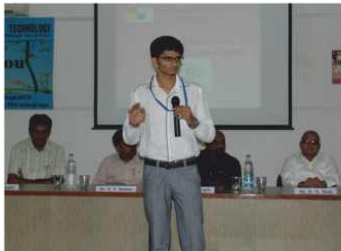
OATH Taking Ceremony of ISHRAE Chapter Members