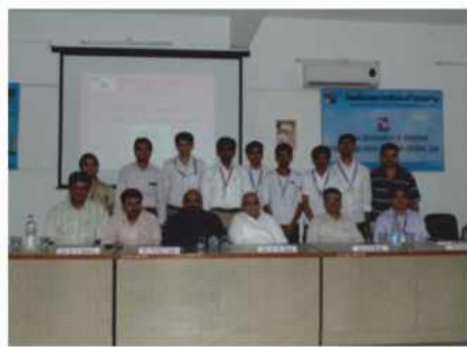
ISHRAE Society Members with GIT Student & Faculty Advisor

ISHRAE (Indian Society of Heating, Refrigerating and Air Conditioning Engineers) arranged its Annual Exhibition ACREX 2015 at Bangalore from 26 th to 28 th February, 2015. As a part of the event, the Annual National Student Quiz aQuest-15 will be conducted during their exhibition. For that, qualifying rounds were organized by all student chapter of India associated with this chapter. ISHRAE Ahmedabad Student Chapter had completed their qualifying rounds on 16 th November, 2014 at AMA, Ahmedabad. There were total 7 teams from the Ahmedabad region. Our college had one team among that. Each team comprised 2 students. List of teams are as follow.