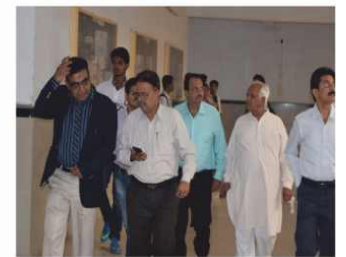
Snap from various events of "GTU Techfest 2015"