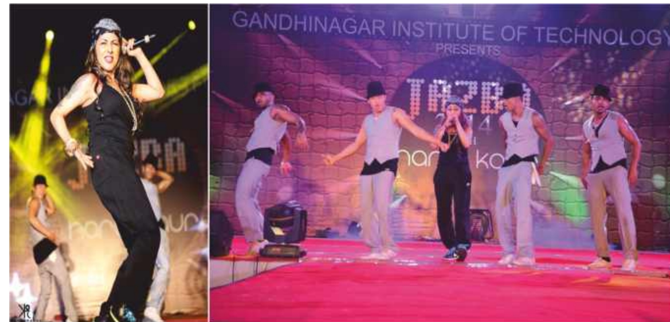
Electrifying performance by famous Bollywood singer "HARD KAUR"