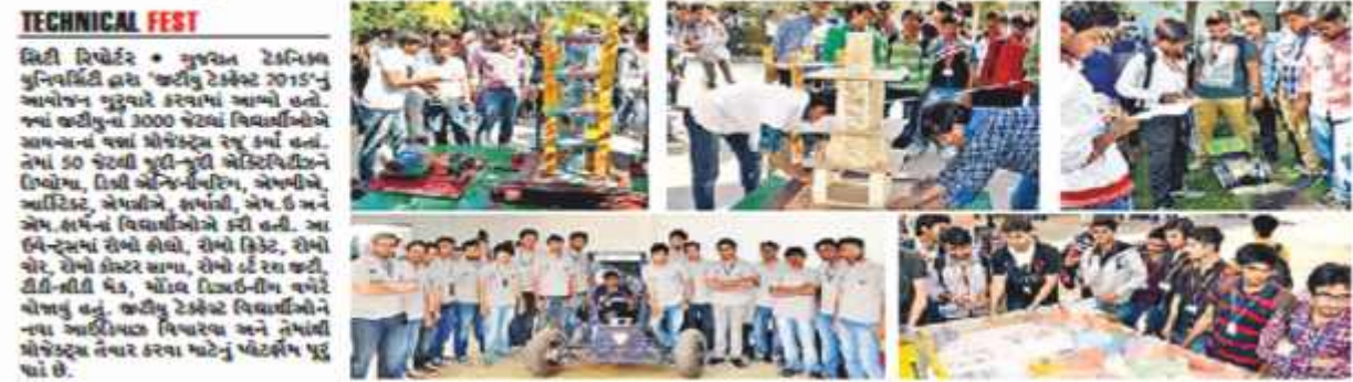
City Bhaskar Ahmedabad, 13/02/2015