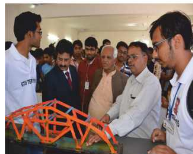
Participants Showcasing their work to the Dignities