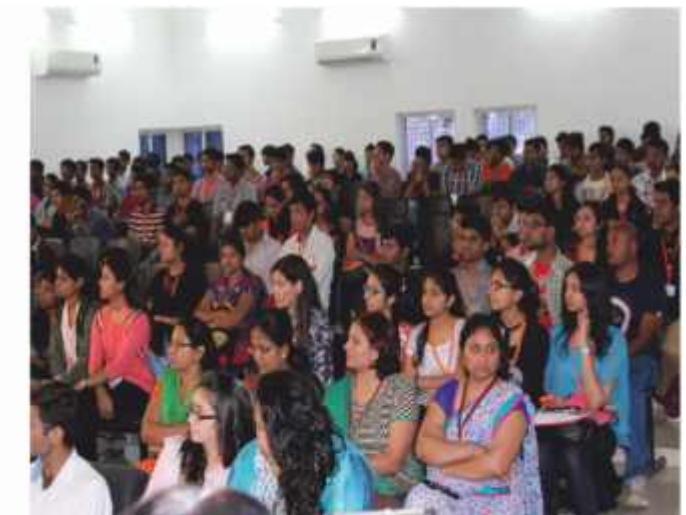
Audience in the Inauguration ceremony