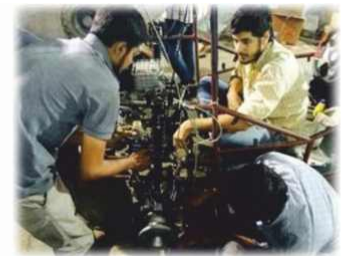
Student manufacturing "All-terrain vehicle" for BAJA student India completion