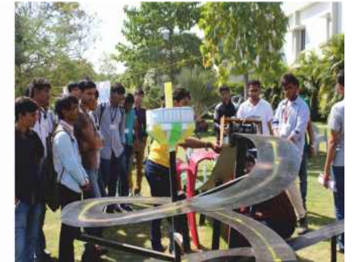
"Robo Roller Coaster"- A first time in India