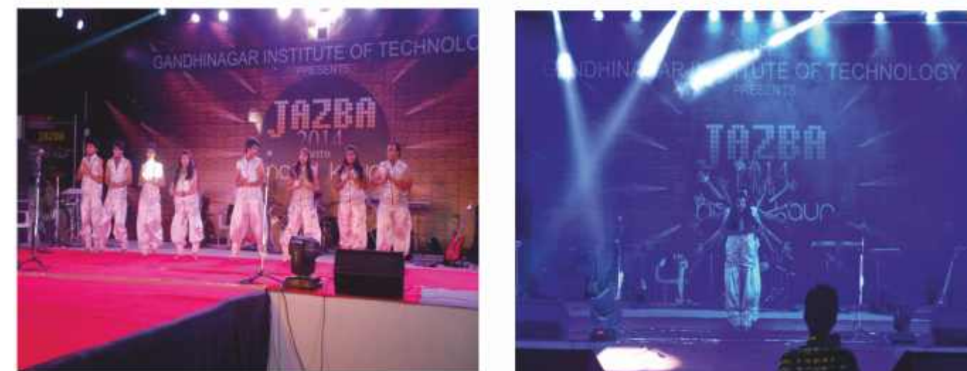
GITians showcased their talented performance