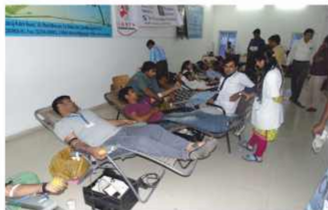
Blood Donated by GITians