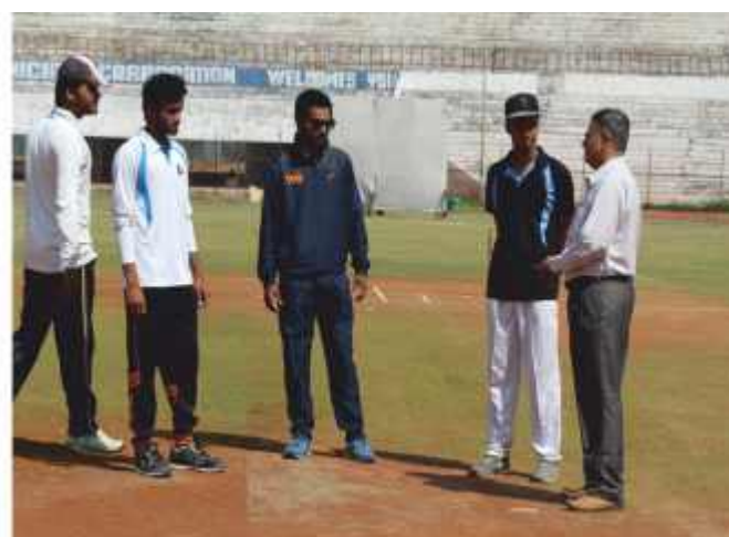
Captains & Match Referee are ready for toss