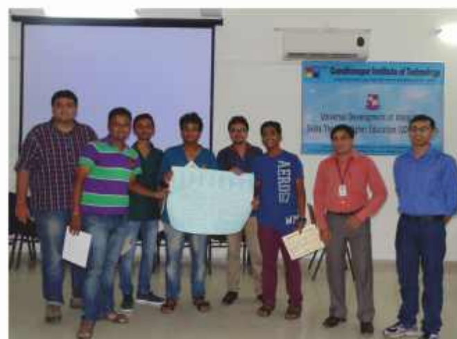
Students' participation in various Workshops and Expert Lecture