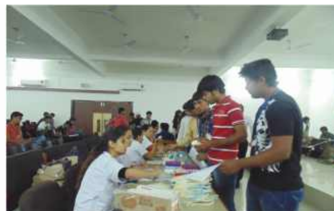
Donors Screening Test