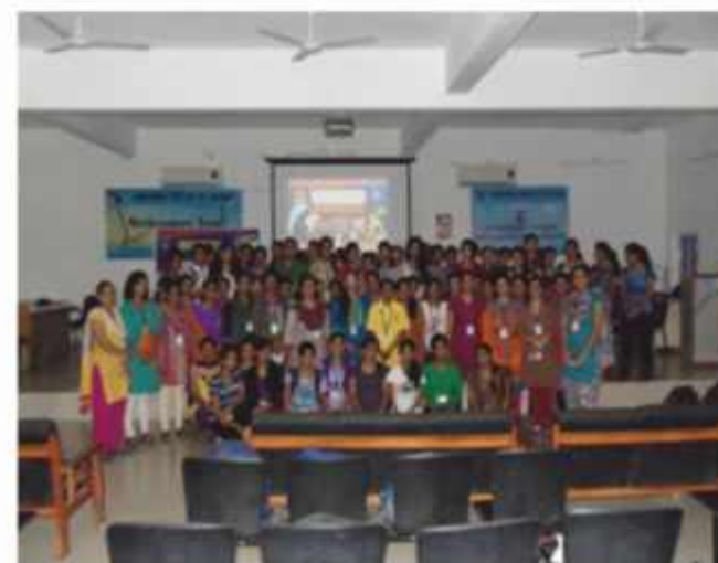
Students' participation in Halla-Bol Event