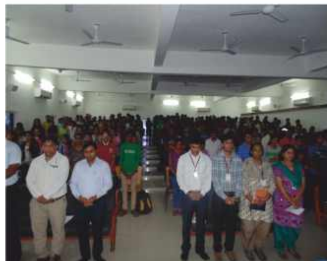
Fresher Students and Faculties in Orientation Program