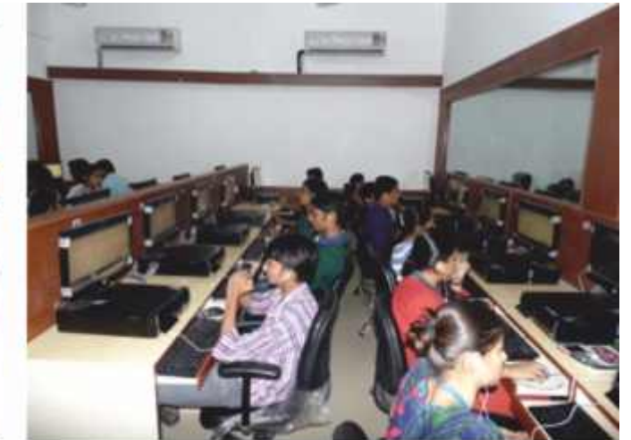
Student Participated at C-102/B