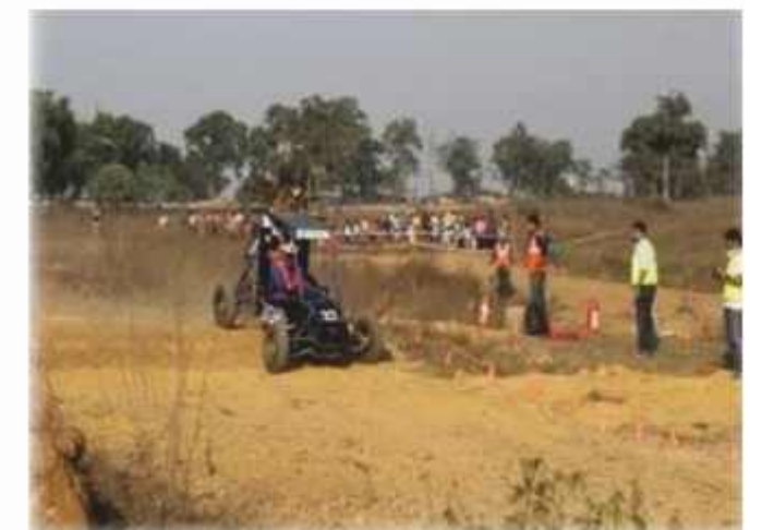
Student performing various tests on 6th to 11th January 2015 in NIT Jameshepur : Technical Inspection, Manoeuvrability Test, Endurance Test Event