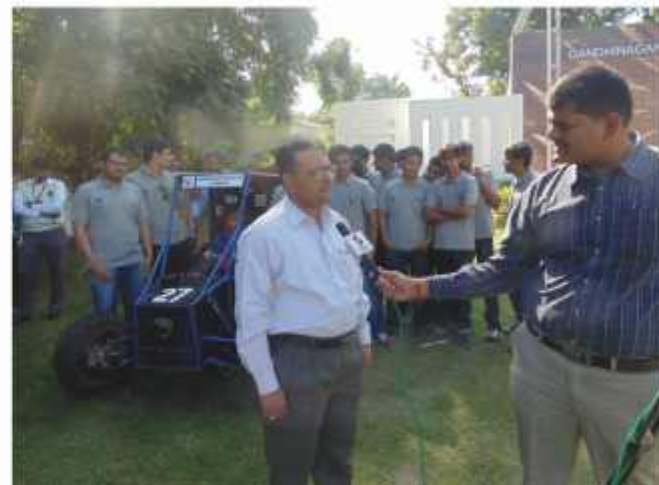
Launching of vehicle on 26 th Dec'14, By Trustee and Director