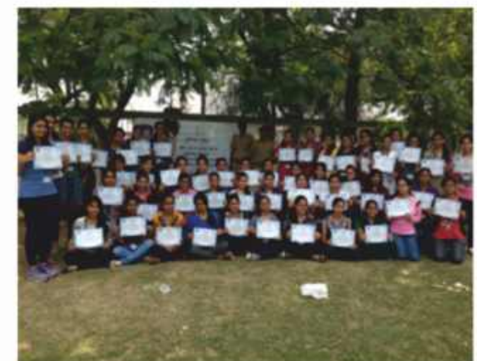
Self Defense training program for Girls