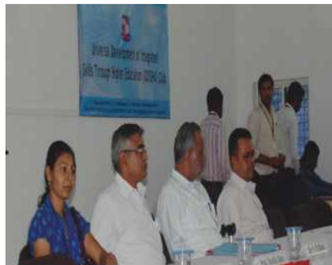
Dignities on the Dias