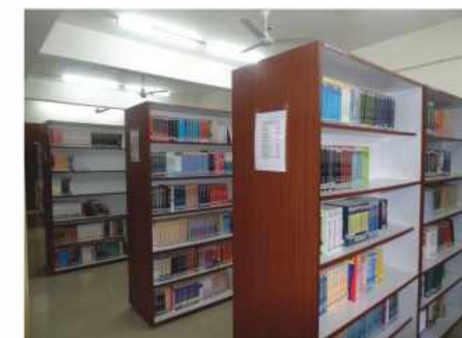
Book Stack Room