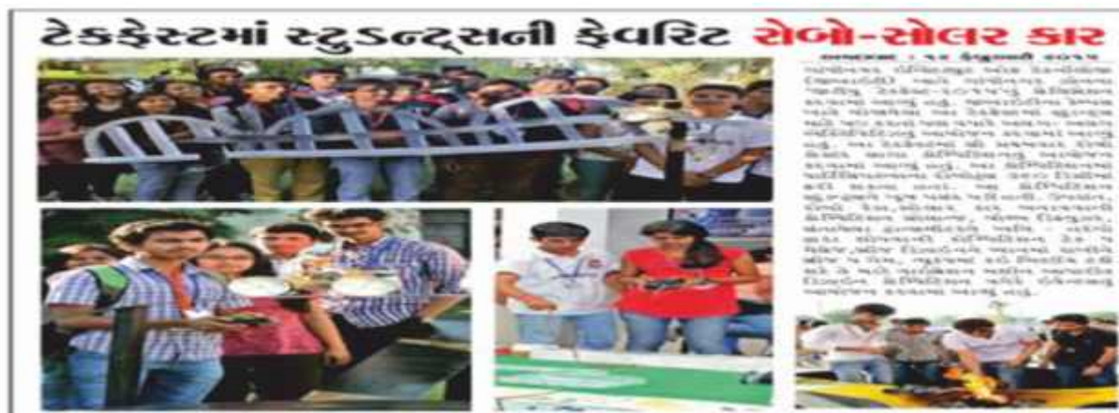
Gujrat Samchar Plus 13/02/2015

Technology might be a geeky term, but to make it fun and creative, Gujarat Technological University (GTU) recently held the Robo Race, Robo War, Robo Soccer and many others. Some of these competitions were introduced for the first time to encourage the creative mind of the Tech students.