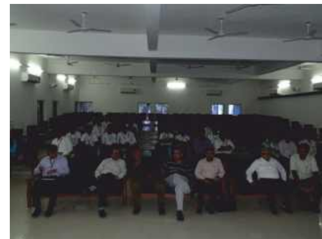
Inauguration function of ISHRAE Student Chapter at GIT

The whole function was celebrated enthusiastically by every member of GIT.