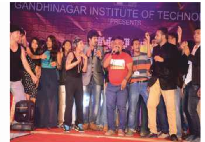
When "Bhai Bhai" meets "Party Abhi Baki Hai"