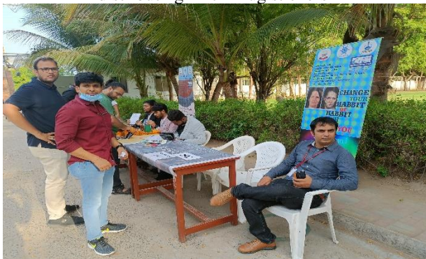
HCC spreading awareness during "Farewell Party of 2018 Batch"