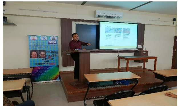
The speaker explaining the reason behind the growing drug consumption