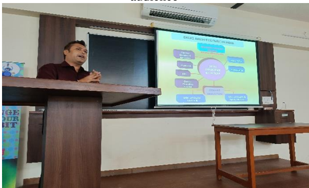
The speaker explaining the demand reduction side of drug consumption