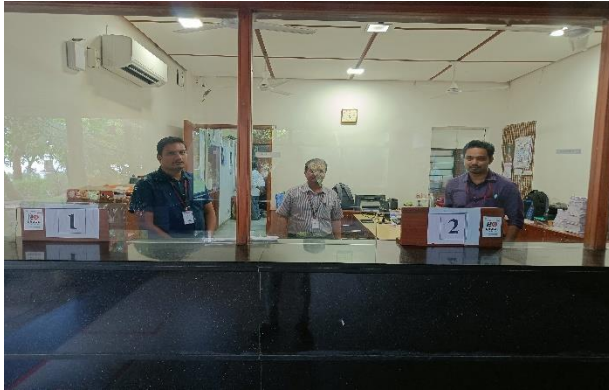
HCC spreading awareness in Admin Department by distributing Anti-Drug stickers