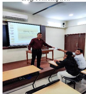
Speaker distributing pamphlets to 2 nd Sem. MBA students