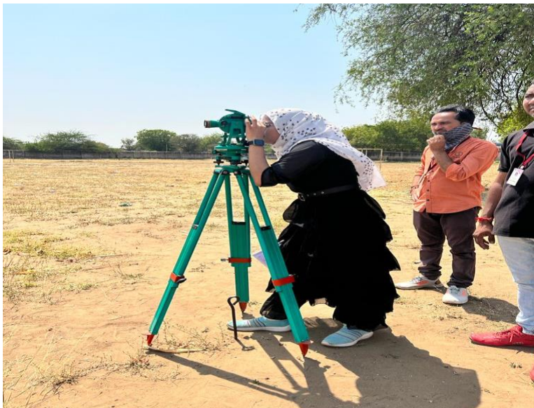
Horizontal Angle Measurement