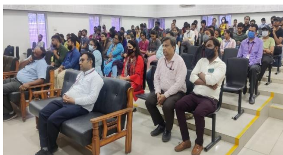
Participants attending the talk