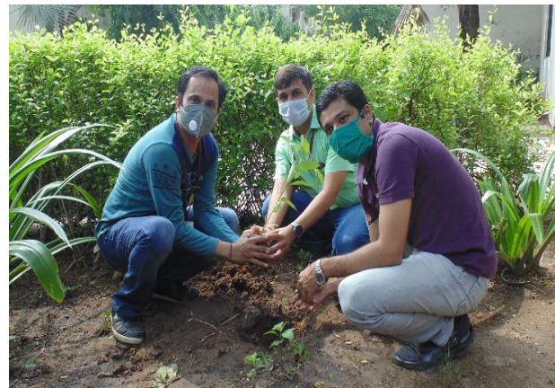
Plantation of Saplings by Faculties from various departments