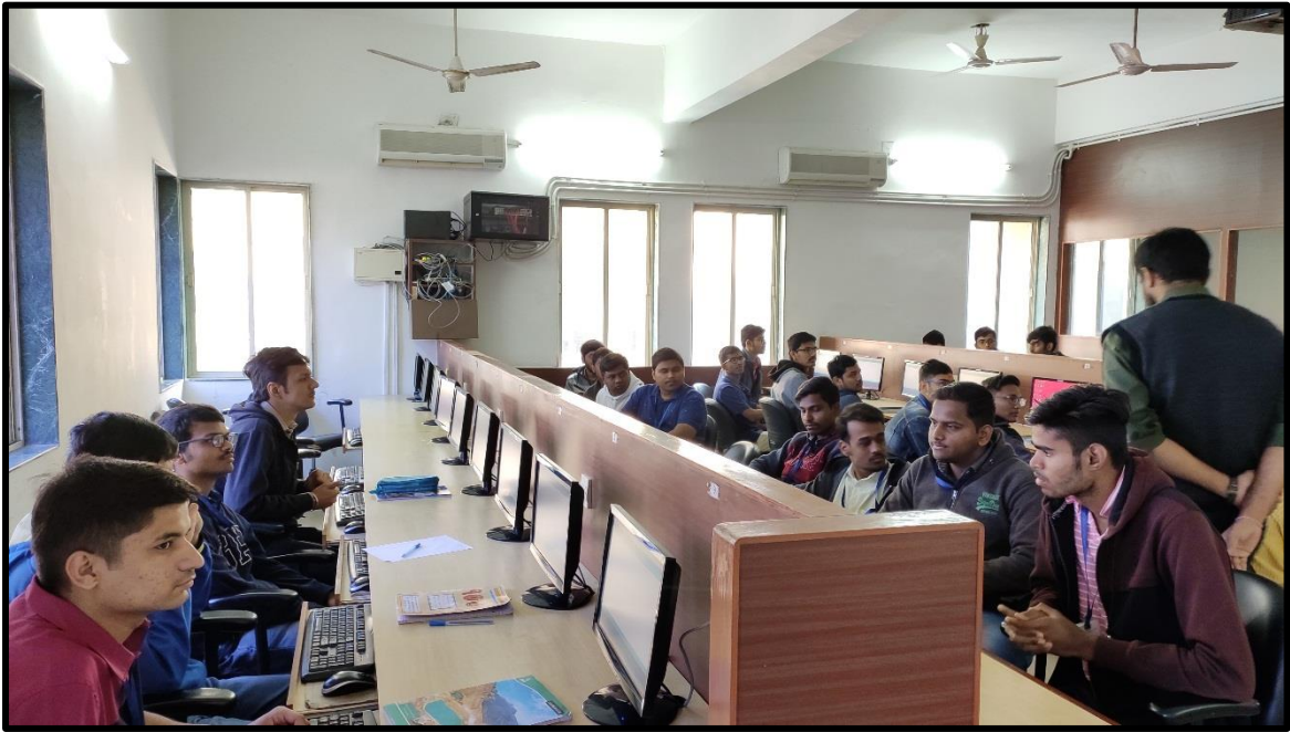
Expert addressing queries;