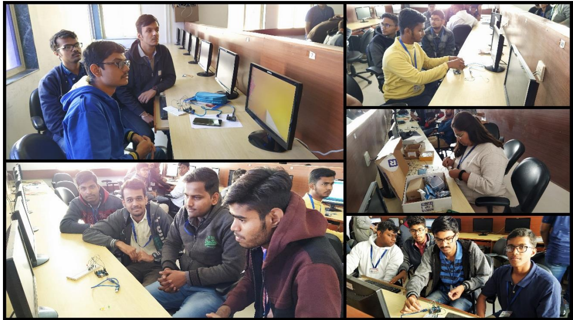
Participants preparing aurdino project;