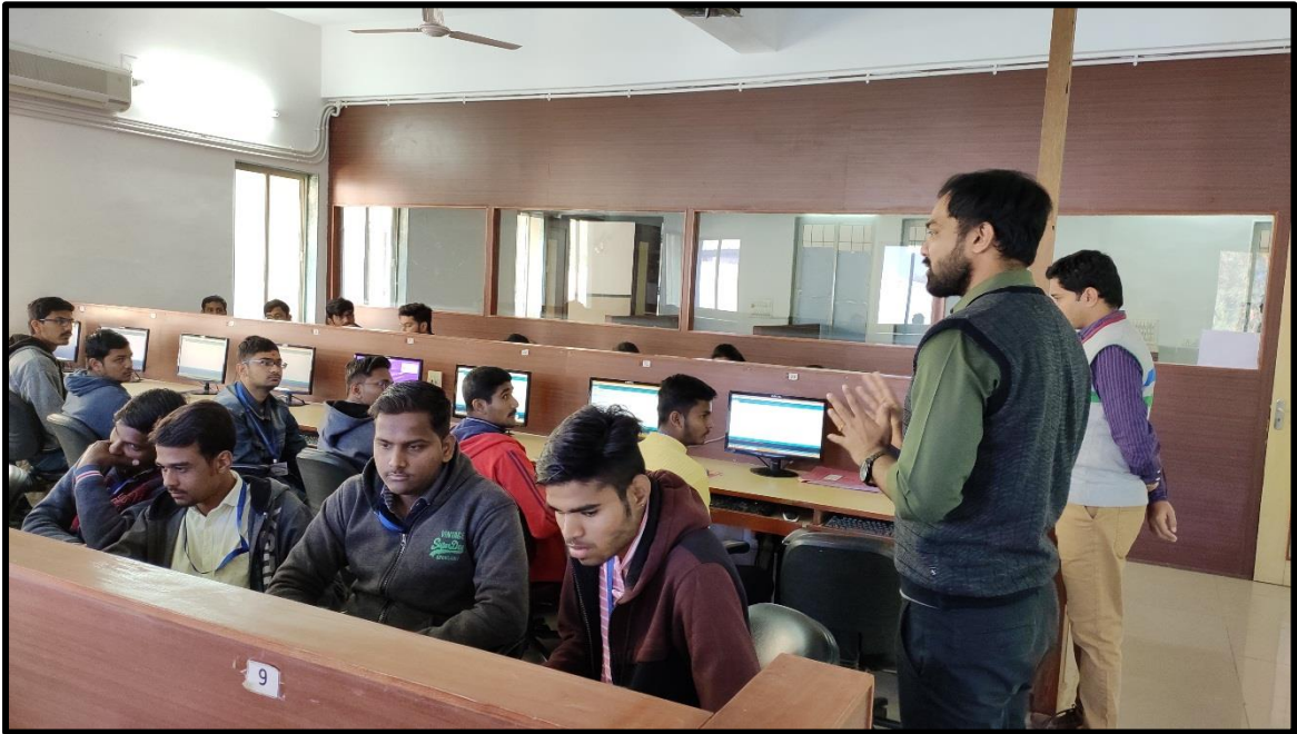
Mentor delivering session