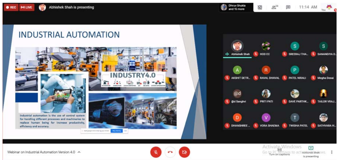
Alumni explaining about Industrial Automation Version 4.0