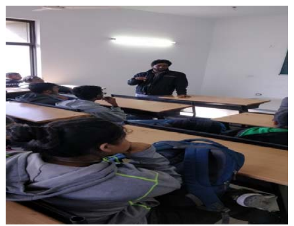
Explanation of Future technologies