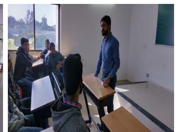
Students from EC & EE with their queries after session