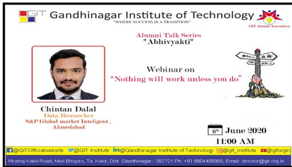
Social Media Creative of the webinar