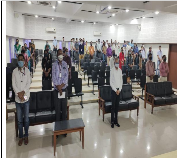
A Picture of Inaugural Function