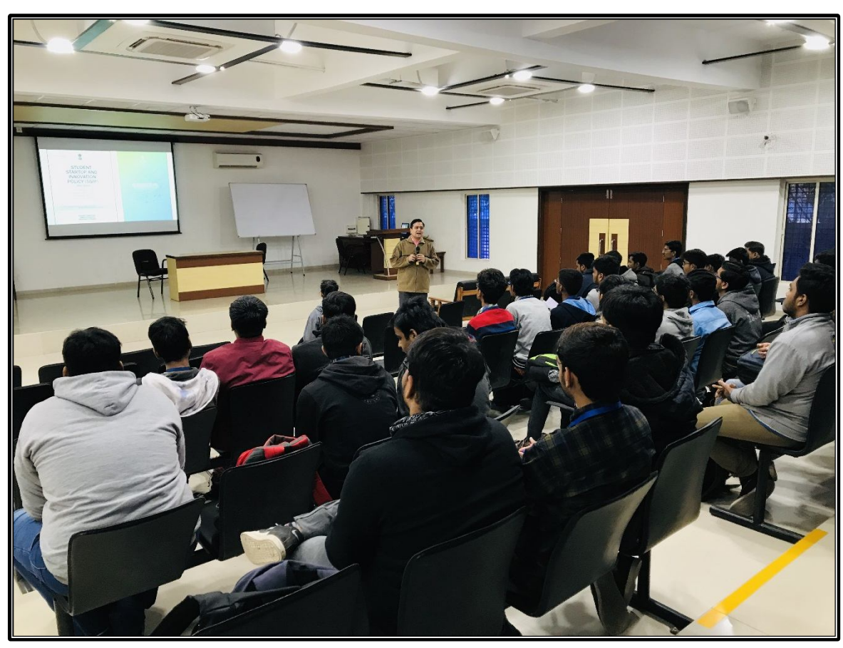
Mentor discussing about SSIP & IPR Policy