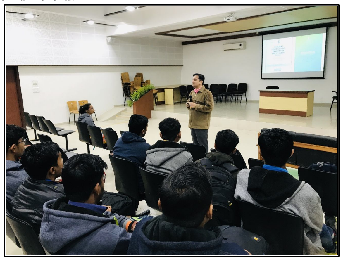
Mentor educating participants