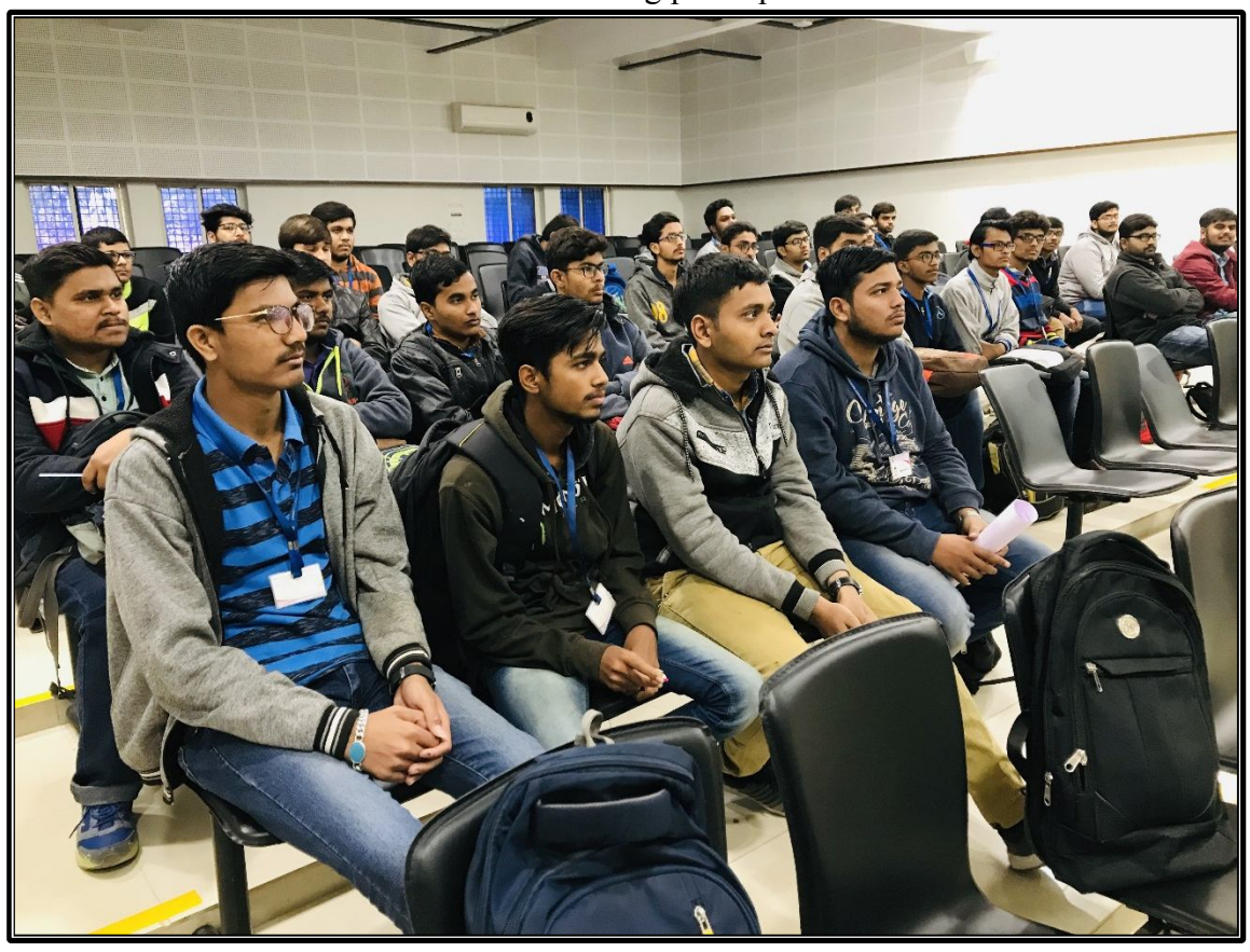
Participants listening mentor