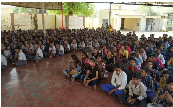
Kids of 'Moti-Bhojan Pay Center School-1' during 'Certificate Distribution Ceremony'.