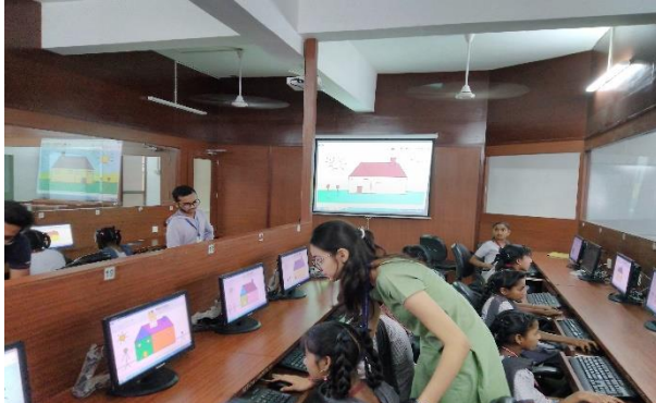
Faculty Volunteer explaining basic computer hardware to the kids.