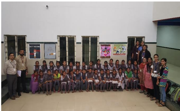
Group photo of Std. 8 girls with faculty and student volunteers of Prarambh.