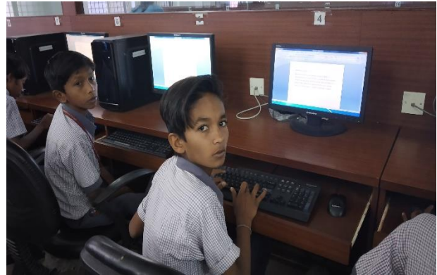
Kids typing an essay about 'Mahatma Gandhi' in MS Word.