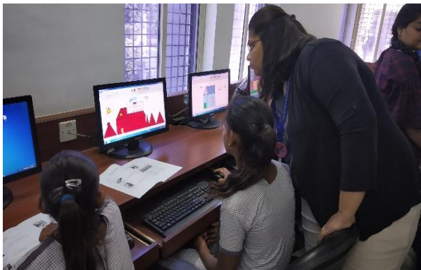
Student Volunteer clearing doubts of students about MS Paint.