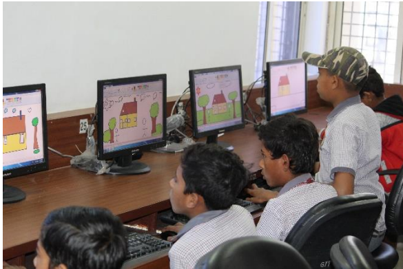
Kids practicing their artistic skills in MS Paint.