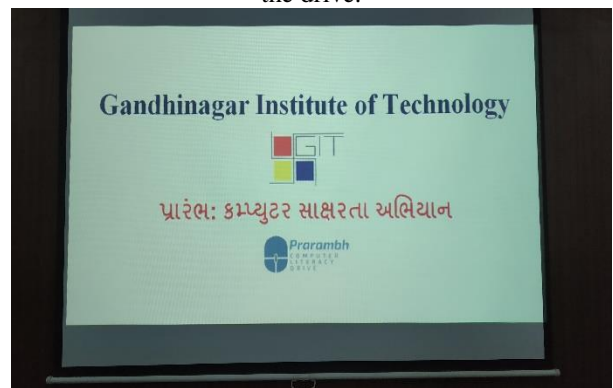
Presentation of 'Prarambh - Computer Literacy Drive'