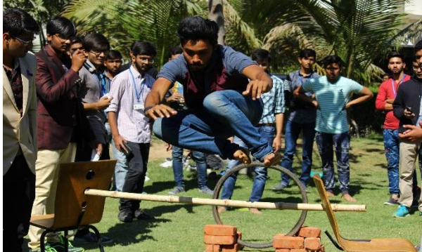
Students in action during the Just A Minute event.