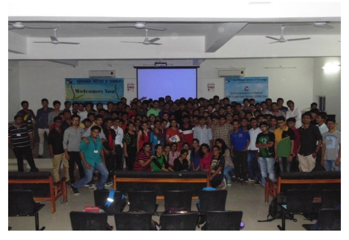
Group photo of participants, co-ordinator and speaker of workshop at GIT premises