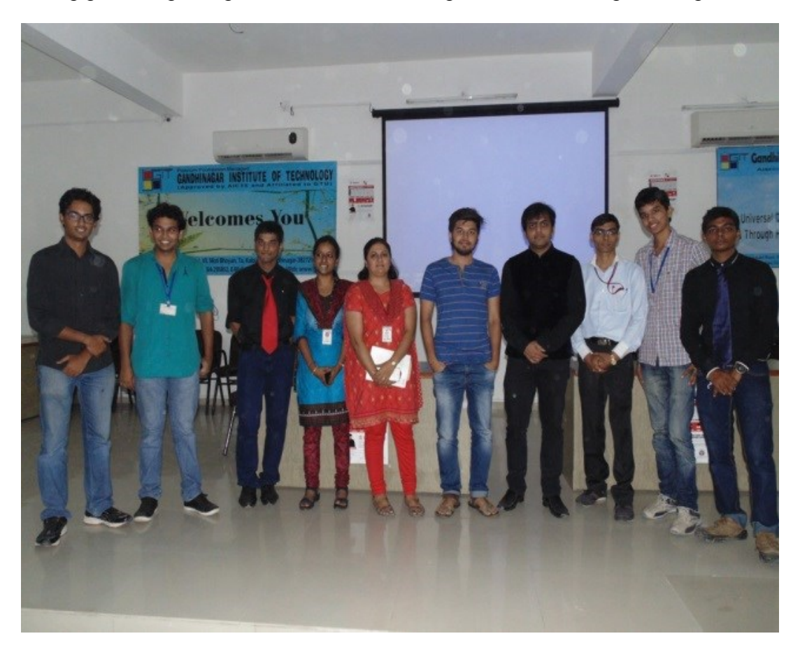
Faculty and Student Co-ordinators with Speaker