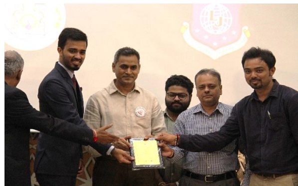
The 'Star Performer College' trophy being awarded to GIT.