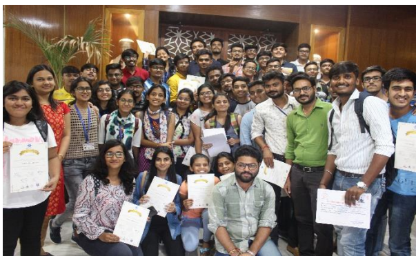
HCC faculty and student members with their participation certificates.