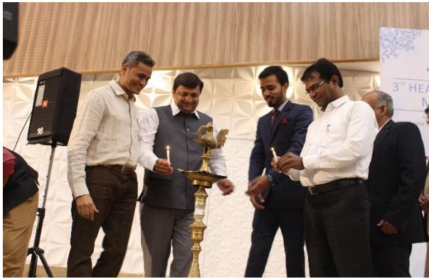
All the dignitaries at the lamp lighting ceremony.