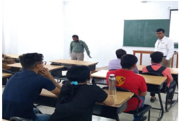
Parents are informed about rules and regulations of GIT and GTU