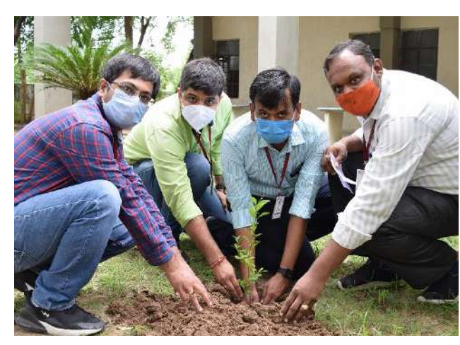
Planting a Lemon Tree by the head of departments