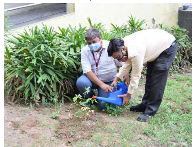
Planting a Tree (Sargavo) by MBA and EC/EE HoD