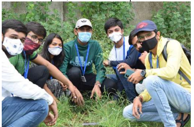
Planting a NEEM Tree by Students group