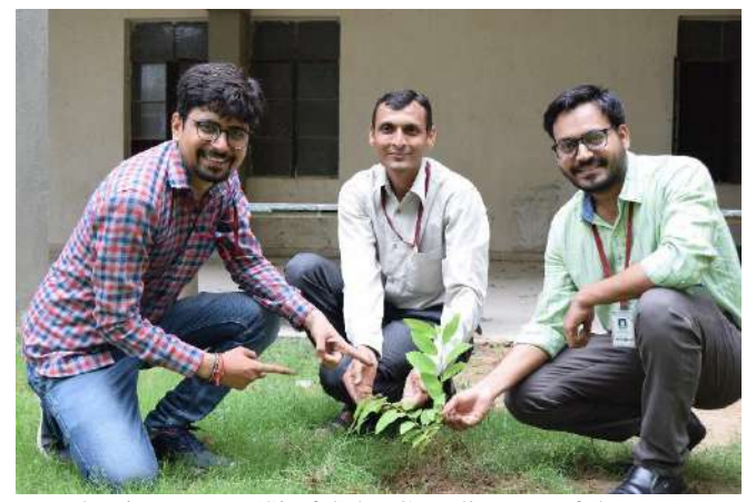
Planting a Tree (Sitafal) by Coordinators of the event