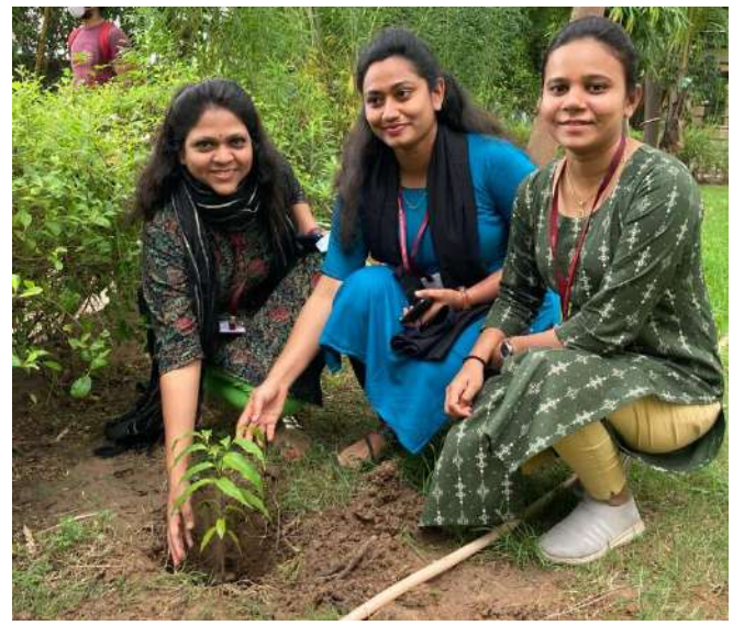
Planting a Tree by faculties of Computer, Civil and Maths department

(Approved by AICTE and Affiliated to Gujarat Technological University)