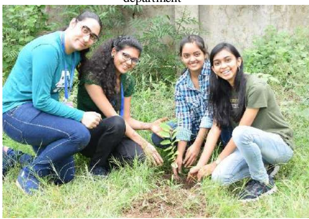
Planting a Sitafal Tree by Students group