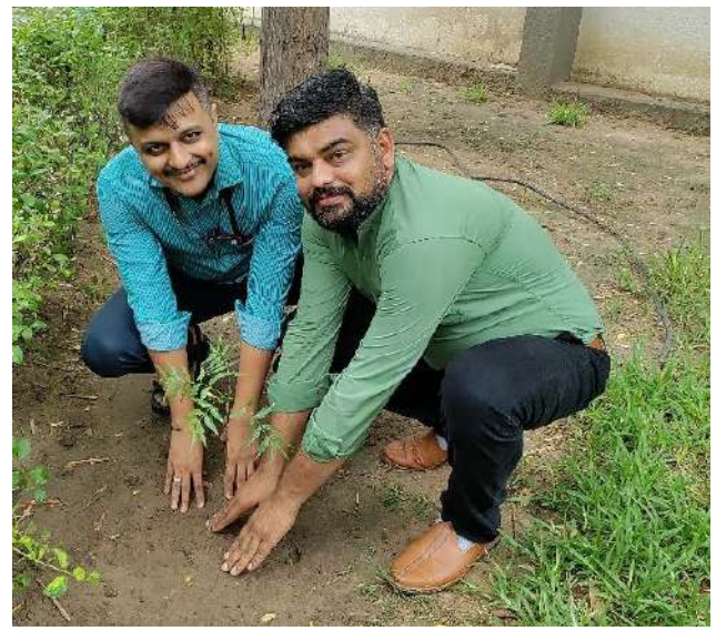
Planting a Tree by faculties of Humanity and Maths department