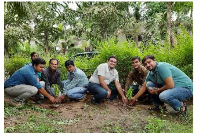
Planting a Tree by faculties of Mechanical and Maths department