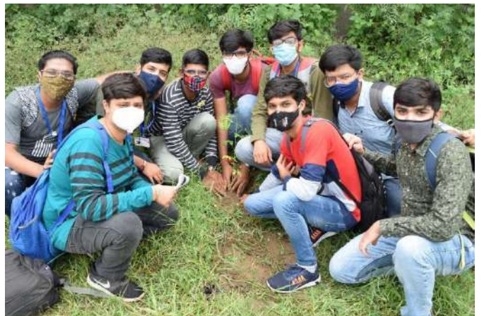
Planting a Sargavo Tree by Students group