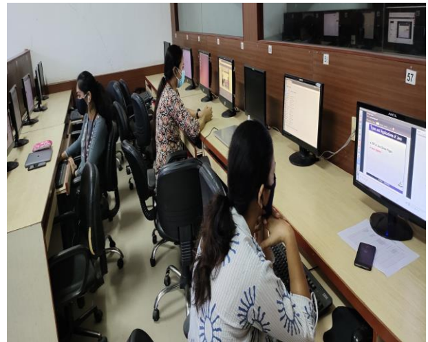
Faculty attending JAVA workshop, Winter 2021