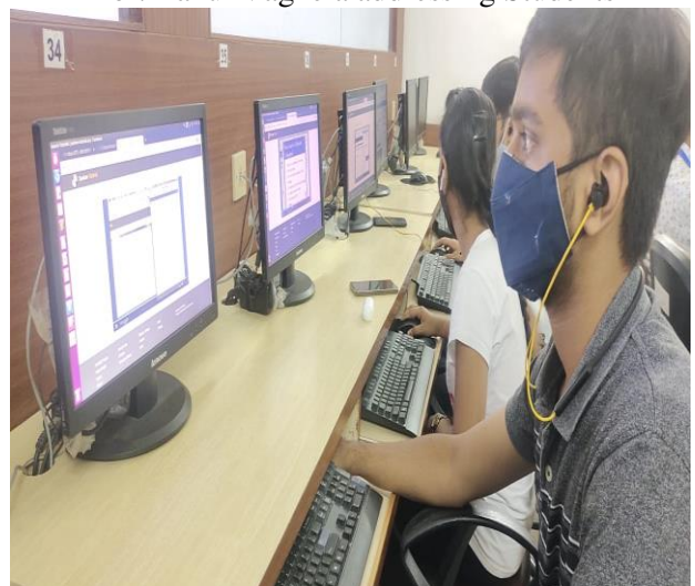
Attending JAVA workshop, Winter 2021