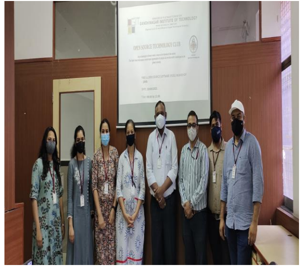
Faculty group photos, JAVA workshop, Winter 2021