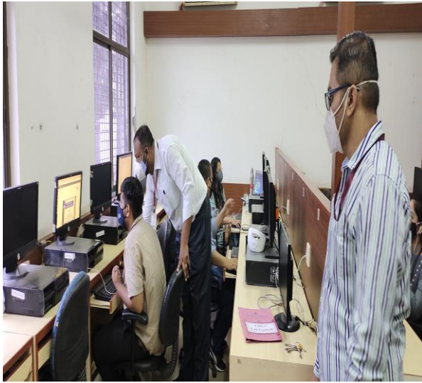
Faculty Members attending C & C++ workshop