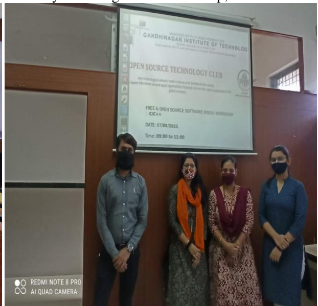
Faculty group photo, C & C++ workshop