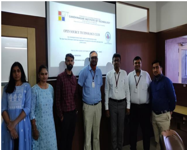
Faculty group photo, LINUX workshop