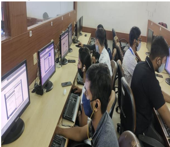
Students attending JAVA workshop, Winter 2021