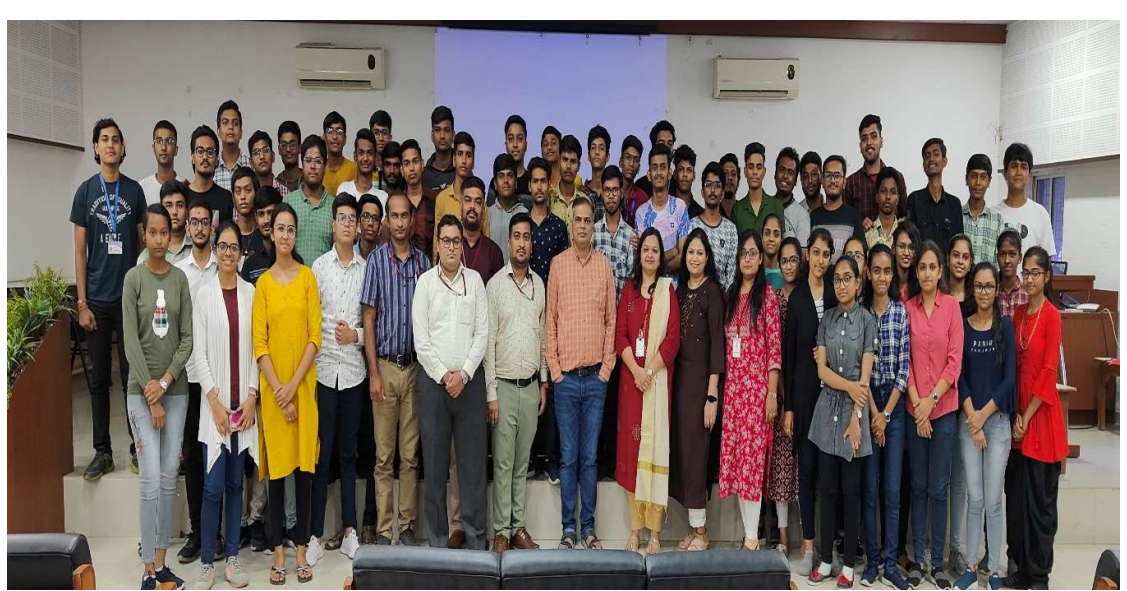
Group Photo with present Dignitaries

(Established and Incorporated Under Gujarat Private Universities Act 2009 Amendment: Guj. 7 of 2022)