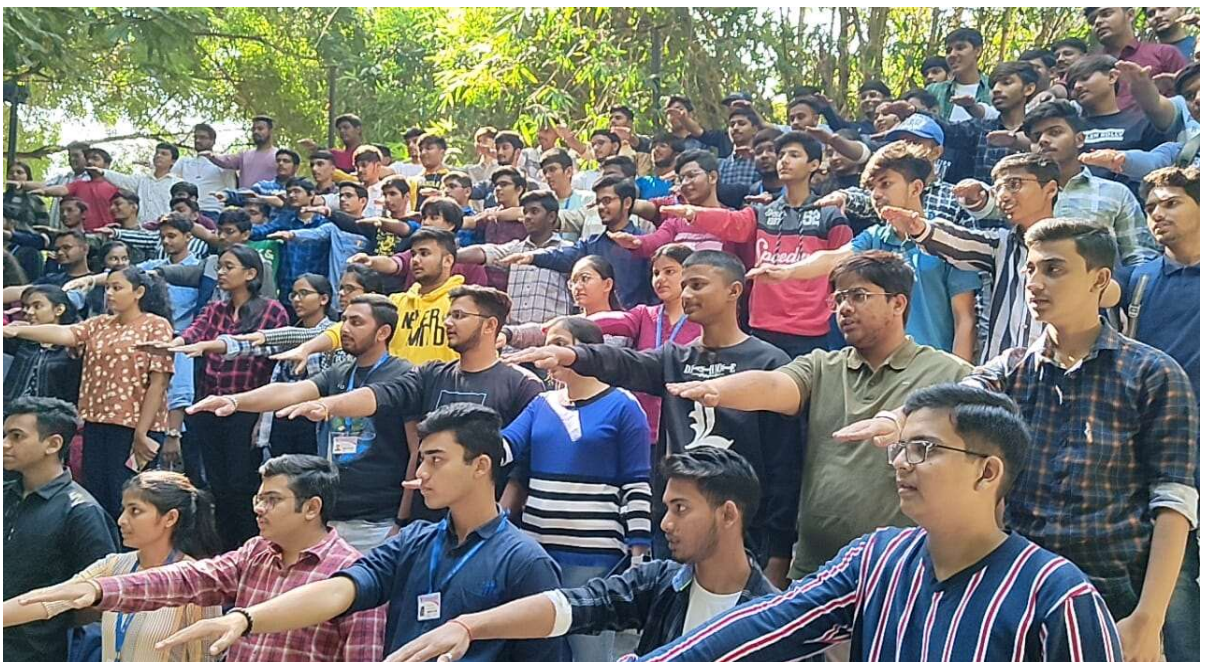
Taking oath for active participation in voting system