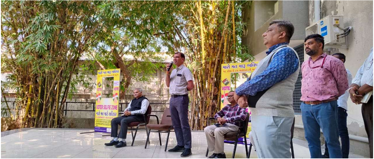
Speech of Shree Sanjaybhai, Member of Election Committee of India