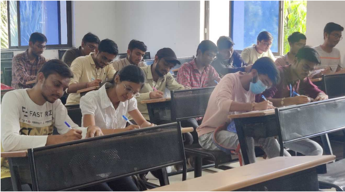
Essay Writing - 1