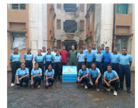
2 Cadets from GIT NCC units were selected to represent the Gujarat directorate in the All India Vayu Sainik Camp.