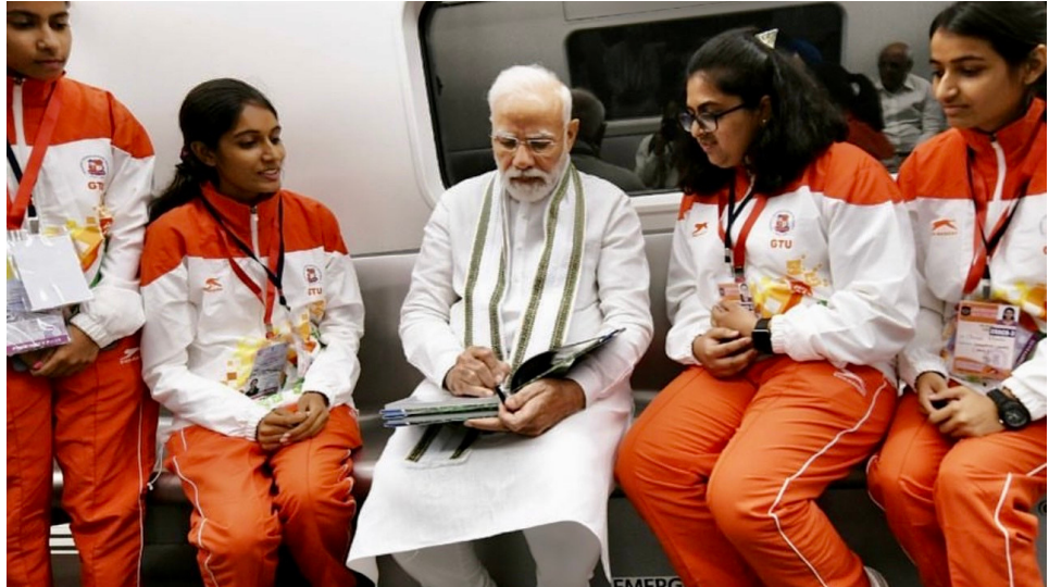
A Student of Gandhinagar University interacting with the honourable Prime Minister during the inauguration of Ahmedabad Metro Rail.