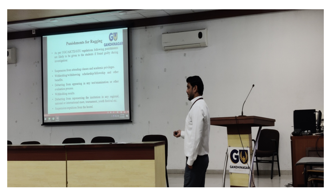
Speaker Explaining about various punishments if found guilty in Ragging