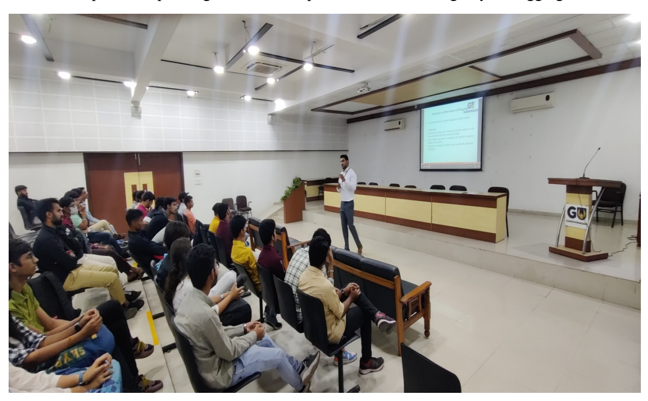
Students in Awareness Session of ARC